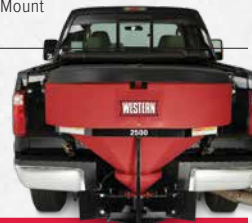
LOW PROFILE 500, 1000 & 2500