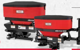
PRO-FLO™ 525 & 900