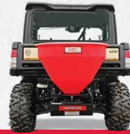
LOW-PRO 300 & 300G